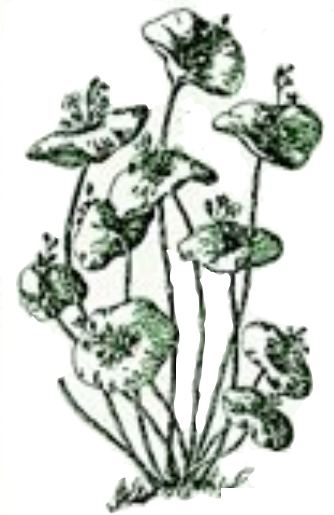
Claytonia perfoliata - miner's lettuce

BRING any kayaks, canoes, spotting scopes, binoculars, cameras, field guides, bikes, fishing gear, etc. for enjoying the day at the lake. (The marina store stocks supplies and rents boats.)