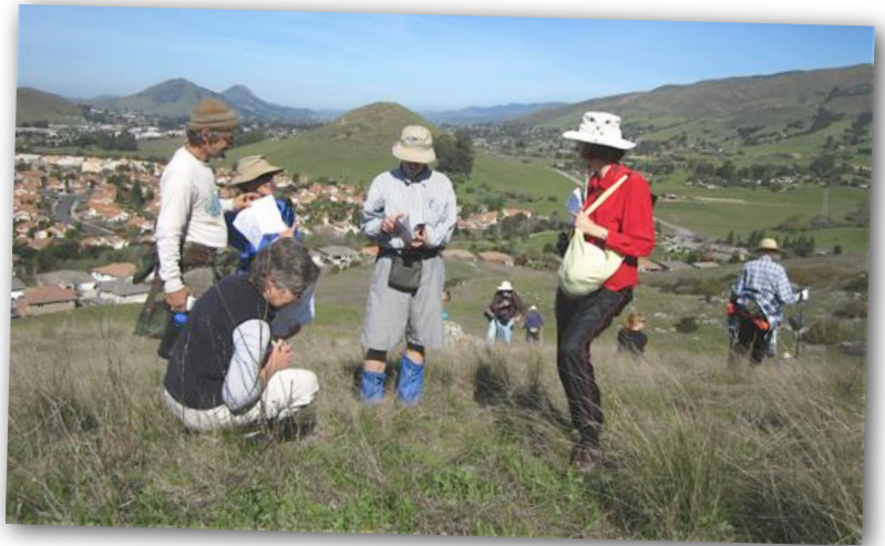
Islay Hill field trip, March 5

Wednesday, April 6, 8:30 a.m., CNPS Chimineas Field Trip: Chimineas is a Dept. of Fish and Game Ecological Reserve in southeast SLO County with wonderful wilderness and wildflowers. To car caravan from SLO, meet at the Veterans Hall (Grand at Monterey), at 8:30 am. At Chimineas meet at 10:00 am at the Feed Lot pull out, on the north side of Hwy 166, 33 1/4 miles east of Hwy 101, 1/4 mile east of Miranda Canyon Road. Have the usual water, food, sturdy shoes, sunscreen, and clothes for the weather. This is an all day trip. Roads are dirt, a little rough but passable; trucks are good; small sedans not recommended. Rain cancels to the following Wednesday. Contact George, (805) 438-3641, or gbutterworth8@gmail.com.