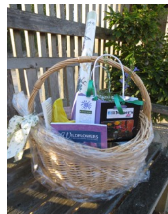
Raffle items provided by CNPS