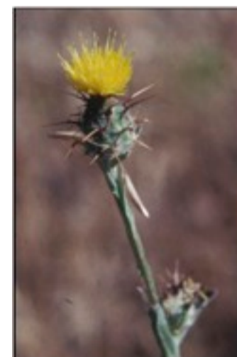
(right) Sometimes mistaken for star-thistle... Centauria melitensis - (Tocalote) with shorter spines (15-20 mm)