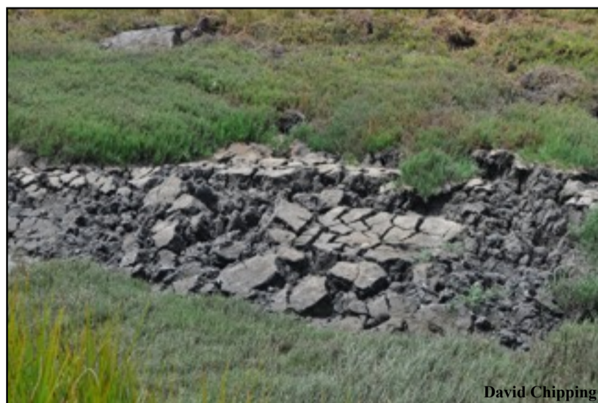
(left) Back-tilted yarrow that slid down the dune face (right) The floor of the old tidal channel now uplifted and fragmented

Editor's Note: Readers of the paper version of Obispoensis will miss the color that you can see in our downloadable web site version. Visit the website at http://cnpslo.org