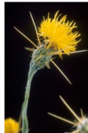
(above) Yellow star-thistle with long 20-25 mm spines

The young, soft plants are easy to remove by hand. If mowing or weed-whacking, wait until onset of flowering. Mow low: a two-inch plant can recover and produce seed. Don't mow if seeds are present. Two of the most effective insects to control yellow star-thistle are Eustenopus villosus (yellow star-thistle hairy weevil) and Chaetorellia succinea (tephritid fruit fly). Two of the best herbicides to use are Milestone (aminopyralid) or Transline (clopyralid). Both are safe for grasses, but not other members of the Asteraceae family.